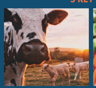
ANIMAL (meat and dairy)

Unique culinary and nutrition characteristics